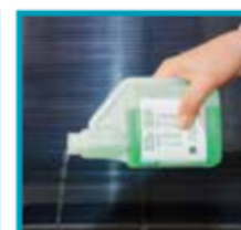
Empty calibration compartment