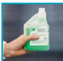
Fill calibration compartment with simple press