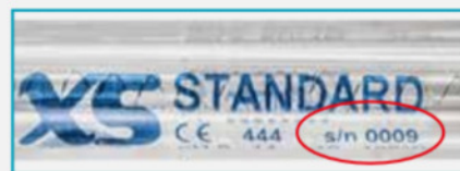
Indelible internal serial number