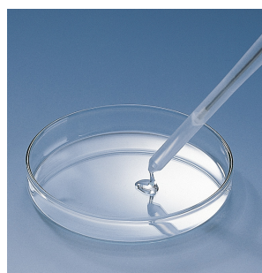
Highly viscous media