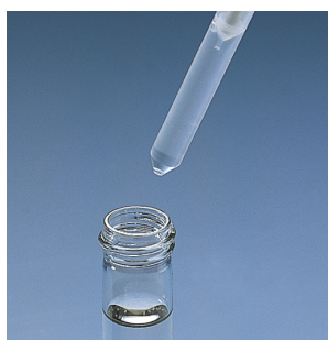
Media with high vapor pressure