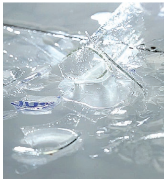
Volumetric flask without coating