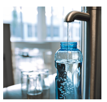
Free water dispenser and reusable bottles to prevent plastic waste