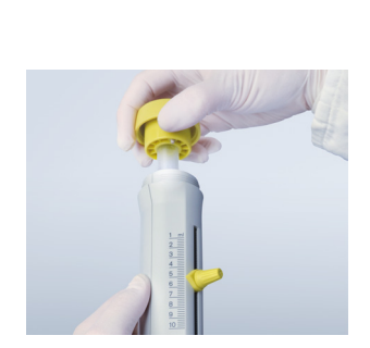
High-quality materials ensure long service life