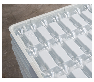
Reusable packaging for production materials