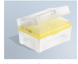
The TipBox can be reused, and autoclaved multiple times